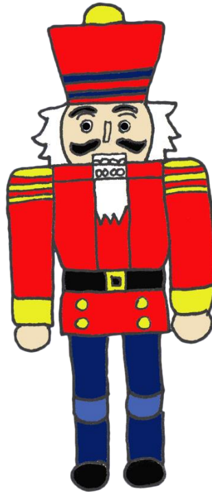
Illustration aus 1840